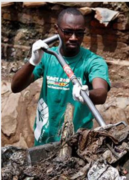
A Rotaract member clears a drainage ditch, a prime breeding

More than 100 members from 19 different Rotaract clubs across these countries travelled to the lakeside city to make a difference in the informal settlement of Nyalenda. A story is told of a young boy who was four years old and had many dreams ahead of him. One evening, the boy developed fevers and refused to eat. Though his mother had a premonition about it, she decided to brush it aside. The preceding week, her other two children, a boy and girl, developed fevers and had reduced appetites but their symptoms had resolved on their own.