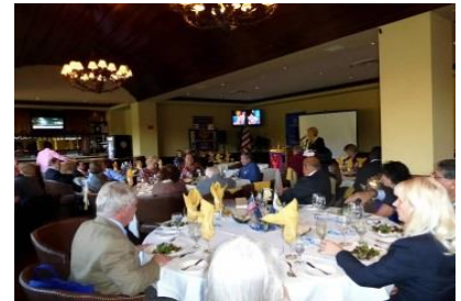
It's a packed house!!