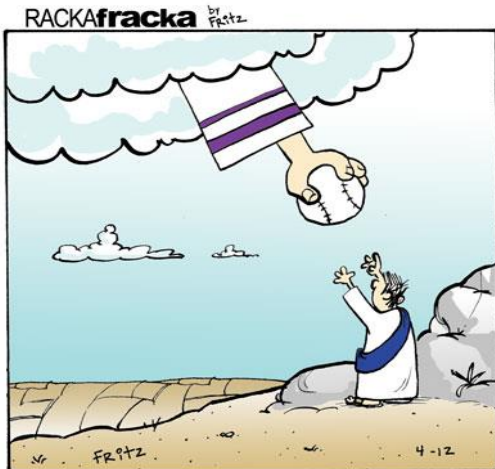
AND THE LORD GAVE MOSES A BASEBALL SAYING, "THOU SHALT NOT SWING ON A 3-0 PITCH."

http://www.sanramonvalleyrotary.com/index.cfm?display=sisterclubs&sub=e